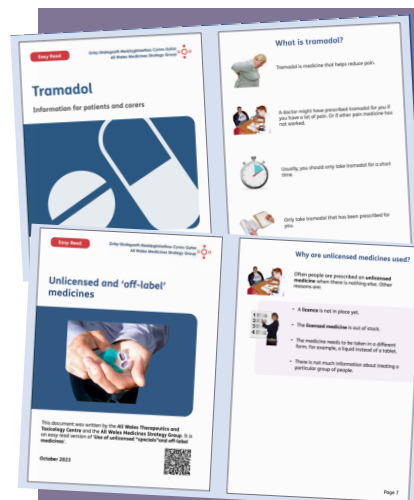
Images show pages from the new easy to read and understand documentation

AWTTTC will continue working with Learning Disability Wales and other organisations in Wales, to develop easy read formats for all AWMSG-endorsed patient information leaflets.